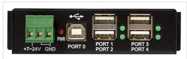
Figure 2. Available ports.