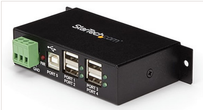
Figure 1. USB 2.0 Hub.

The newer counter box introduced into the Entegris AccuSizer product line is referred to as the multi-channel pulse analyzer, or MCPA counter. This replaced older counter boxes we now refer to as legacy counters. Your MCPA particle counter may include the USB hub shown in Figure 1. This technical note provides guidance on why and how to install the USB hub.