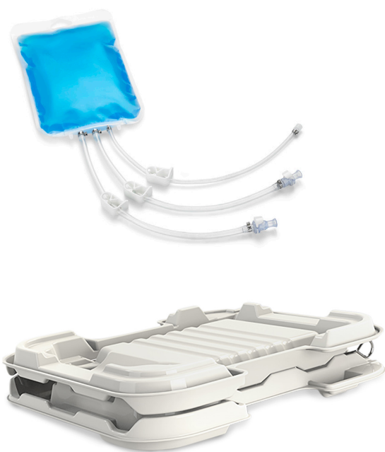
Aramus single-use 2D bag assembly and Entegris blast freezing shell.

Aramus™ single-use 2D bags, combined with the Entegris blast freezing shells, provide an easy-to-use, lightweight, and reusable secondary container solution for use with controlled rate convection or standard lab cold-wall freezers. The blast freezing shells are provided double bagged and are boxed in quantities of 10 (2 L shells) or 5 (5 L shells). This document explains how to most effectively handle and reuse the Entegris blast freezing shells in cold-chain applications.