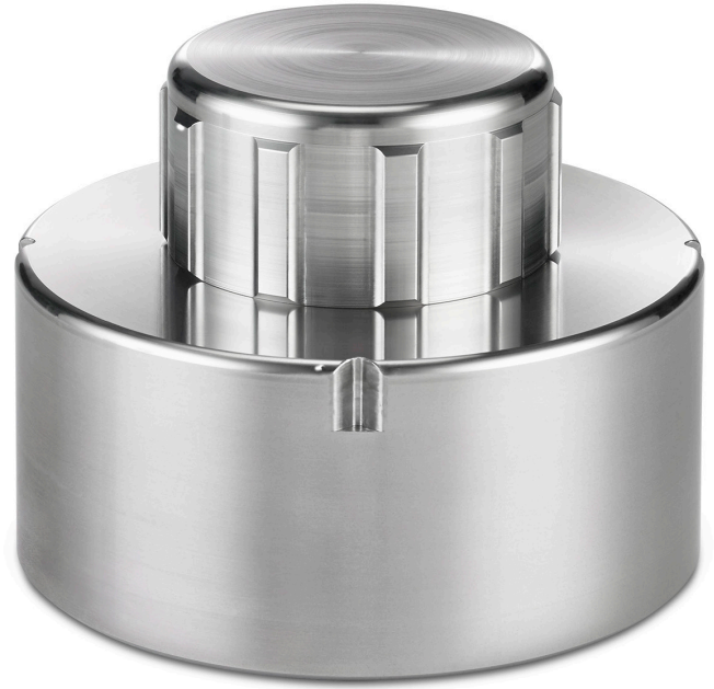
NCV-200-T cap and NCV-200-B high-viscosity closure